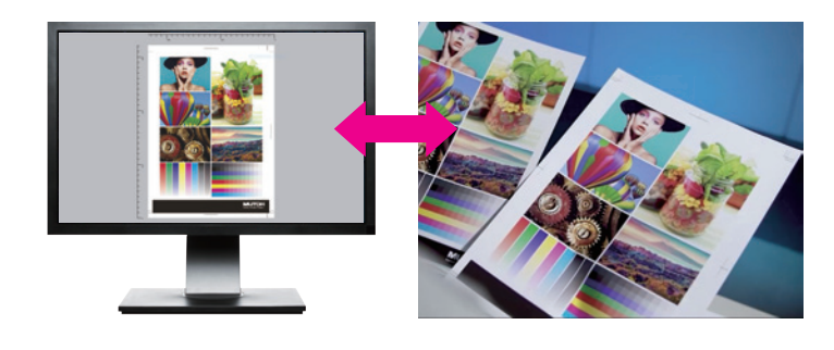
For soft proofing, a display with monitor calibration is recommended