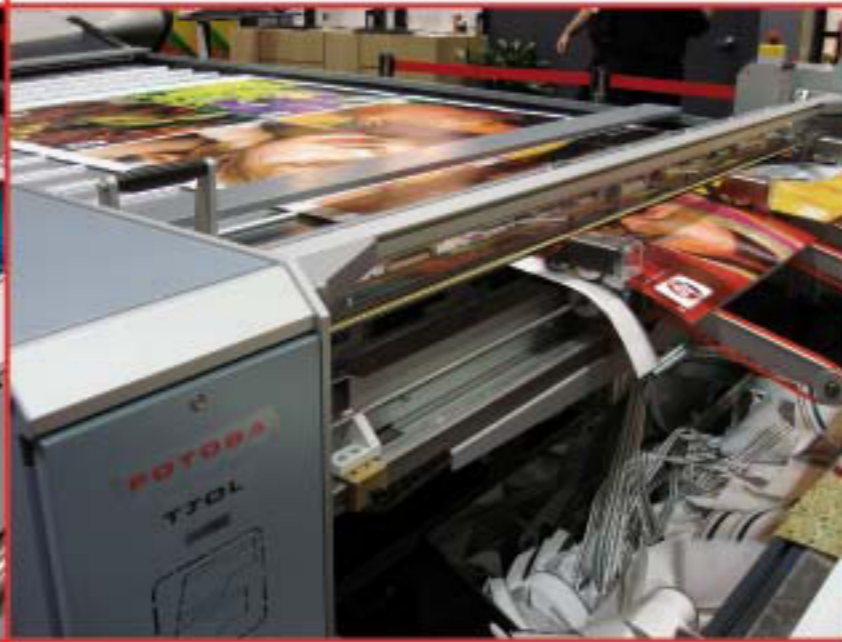
The cutter reads the FOTOBAs CUT MARKS , squares the X and Y blades to the image edges and automatically finishes the job.