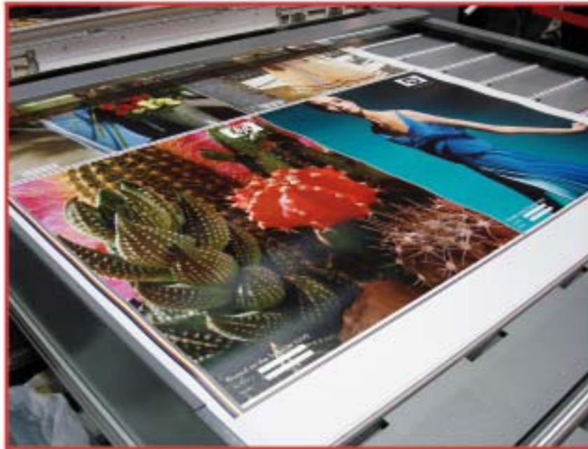
The Automatic Alignment Table receives the printed page from the printer and feeds it correctly into the cutter.

Re-printing because of damaged prints down the line in the finishing operation is now completely eliminated.